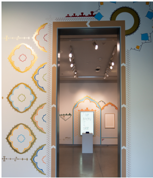
2024 Faculty Biennial

Libby Rothfeld, Felix's Community (#5) , 2020. Laminate, tile, grout, wood, plastic bags, Post-it notes, pencil, plastic tub, resin salt shakers, pepper shakers, hand sanitizer, face toner, inkjet print, and Plexiglas.