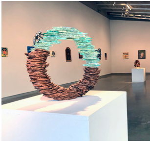
Reflection (Curated by Teen Art Group) 5/20 - 7/28

Installation view of Reflection , a group exhibition curated by Teen Art Group.