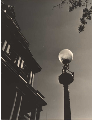
Ilse Bing: Doublings 5/22 - 8/6

Installation view of Reflection , a group exhibition curated by Teen Art Group.